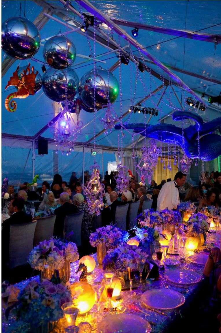
Sandy Bottom Lair table inside the tent on the wharf