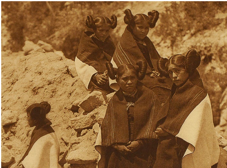
Detail of “East Mesa Girls,” 1921 photograph by Edward S. Curtis

Powered by Science. Inspired by Nature. Founded in 1916, the Santa Barbara Museum of Natural History inspires a thirst for discovery and a passion for the natural world. The Museum seeks to connect people to nature for the betterment of both, and prides itself on being naturally different . For more information, visit sbnature.org .