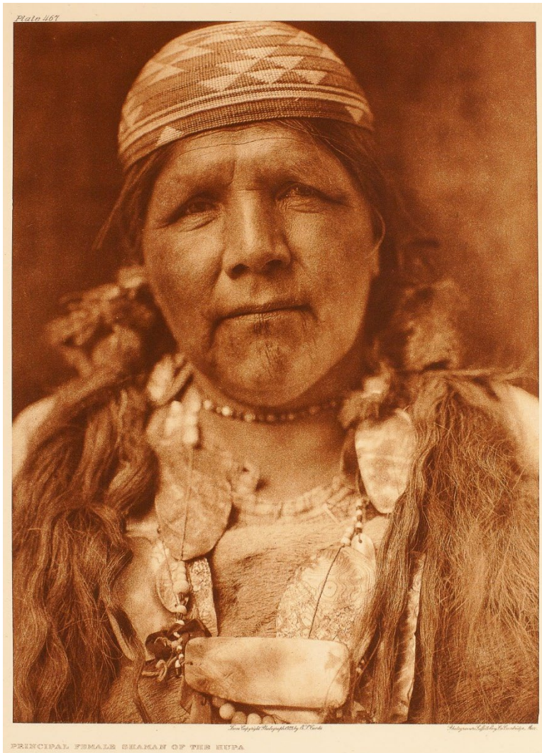
"Principal female shaman of the Hupa," 1923 photogravure by Edward S. Curtis