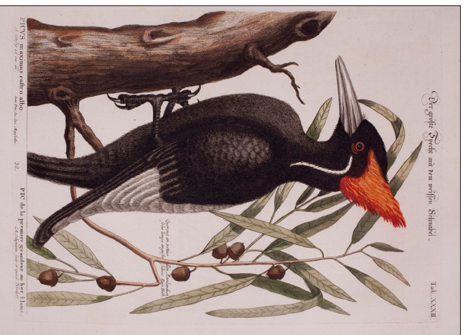
Mark Catesby - 1730 - The Natural History of Florida, Carolina and The Bahamas

Be a scientist: Closely observe these three images of the now-extinct Ivory-billed Woodpecker. Circle or list three things that are the same and three things that are different in each image.